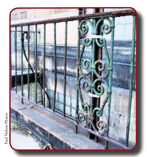
Original green iron railing

Museum Board Member Stu Warner managed the program of recreating the balconies using original architectural drawings and photos of the exterior of the building. Precise measurements were established to carefully recreate the structure and the intricate curves and bends. The well-respected Rose Iron Works of Cleveland fabricated the balcony and created a pattern that can be used to manufacture the remaining five balconies when funds become available.