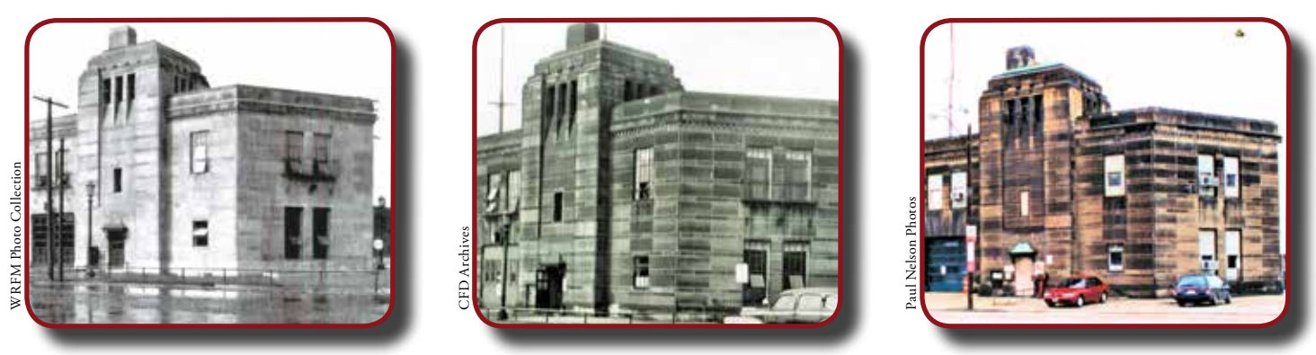
310 Carnegie Ave. 1926