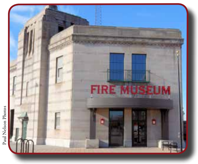
Final restoration completed October 31, 2015

The Museum is responsible for all restoration costs to the building which has been designated as a historic landmark by the Cleveland Landmarks Commission and Cleveland City Council in 2005. The east façade restoration was made possible in a large part by two generous grants from the Reinberger Foundation. Our sincere thanks to the Foundation for their assistance. The Museum is currently seeking grants that will help in completing the restoration of the remaining balconies, remaining windows and the five big apparatus bay doors.