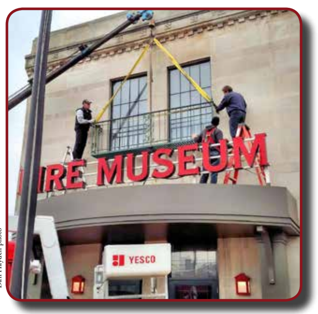
Installing new balcony

A decorative canopy and signage were added above the new entry doors. The base of the canopy columns were covered in Berea sandstone quarried at the same site as the original construction stone. Two Cleveland fire alarm street box shells were modified to serve as illuminated coach lights on either side of the entrance doors. (Continued on page 2, see Historic Restoration