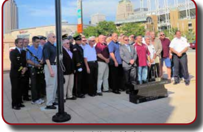
Active and retired Cleveland firefighters