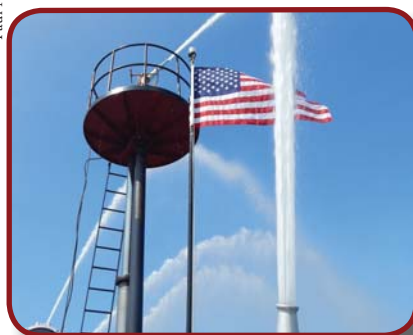
Buffalo Engine 21