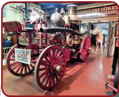
Buffalo Fire Museum

We are pleased to offer this special opportunity on a first come, first served basis starting in 2016. Birthday parties are an important activity at many other fire museums around the country. We look forward starting our own traditions at the Western Reserve Fire Museum and Education Center. The Museum will also be available for special events including meetings, retirement gatherings, and group tours. Check the website, www.wrfmc.com , for further information on birthday parties and events.