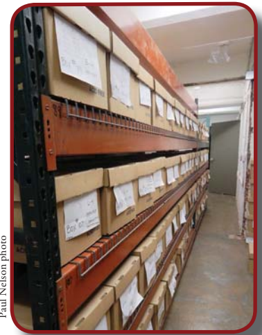
Basement archive storage area

Once all the racks are installed, other archival material will also be moved into the room. The completed room is the work of countless volunteers who have been involved in demolition, pipe fitting, electrical and lighting, alarm systems, carpentry, brick-laying, concrete finishing, floor restoration, cleaning, painting and last but not least moving heavy boxes. The project was completed with the installation of the racks that were sized and positioned in the room to maximize usable space. Another example of how the Museum has made great progress through the generous help from our volunteers.