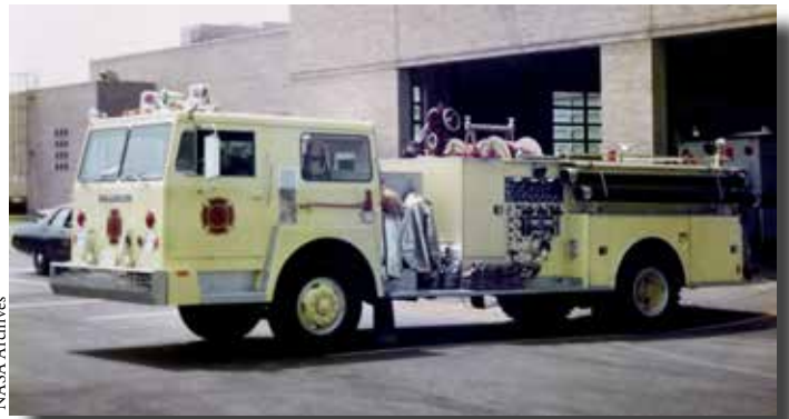
1974 Darley/Hendrickson/IH 1250/500 Engine 9

About that time AERL acquired a Cardox Type 150, 6,000-lb CO2 crash truck believed to have been used at the Cleveland Aircraft Plant No. 2 during WWII. That facility adjacent to the airport's administration building had another Cleveland fire department with five units and several CD trailer pumps.