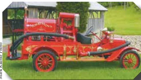
Mark Radkte Photo

Over the course of the exhibit run Model groups will hold events at the Museum, of their vehicles at the Museum. Watch finalized.