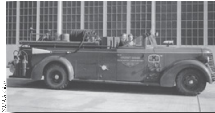
1942 ALF Model 675 750gpm/CO2

Work officially began at AERL on May 8, 1942. Fire protection for the site began with the arrival of a 1942 American LaFrance, 600