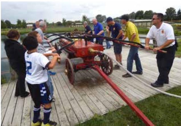
Volunteers pumping Hudson's 1859 hand engine.