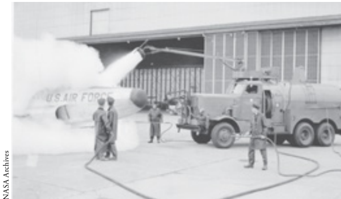
CARDOX Type 150 6000lb CO2 Crash Truck (Ex OCD WWII)

Series (Model 675) 750gpm pumper with CO2 delivered by two reels. Serial number L1771 was delivered on December 7, 1942. By 1947 a white Packard ambulance was added, the ALF doors were changed to reflect the new name and the fire department members sported new uniforms.