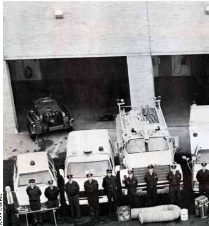
(l to r) Car 1 Command; Squad 7 back up; Engine 8 1978 Fire-Tec/Chev; Sq 1250/500; Rescue 12 1976 Dodge/Stahl Boady; Truck 6 Ha

The National Advisory Council for Aeronautics (NACA) was created by Congress on March 3, 1915 to "supervise and direct the scientific study of the problems of flight with a view to their practical solutions." It was dissolved on October 1, 1958 with the creation of the National Aeronautics and Space Administration (NASA) that exists today. In 1941 NACA established its Aircraft Engine Research Laboratory on the west side of the airport that eventually extended into both Brookpark and Fairview Park. AERL was one of four NACA sites in the US. It was renamed the Flight Propulsion Research Laboratory in 1947 and was named the Lewis Research Center (LeRC) in honor of George Lewis, NACA Director of Aeronautical Research when it became a NASA facility. For the record the site was renamed the John H. Glenn Research Center at Lewis Field in 1999.