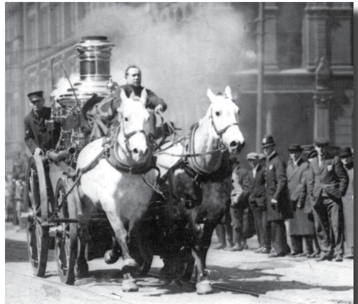
1900 La France steamer of Engine 2 on run

The conversion to motorized apparatus in the Champlain