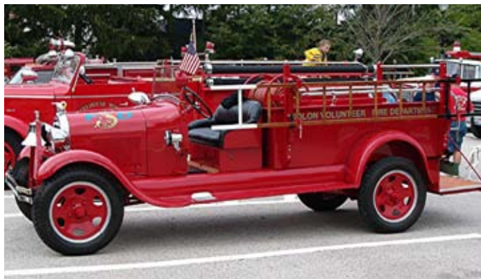
Solon restored Model T