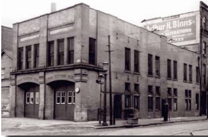
Station No. 2 312 Huron Road

and converted to a 2-bay firehouse facing Huron. The two top floors were removed in 1932 making it look like a pretty typical firehouse.