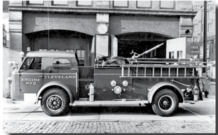
Engine Co. 2 1951 American LaFrance, 1500gpm in front of Huron Road station. First CFD 1500gpm pumper.