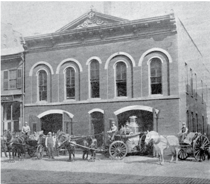
Station No. 2 with 1885 Clapp & Jones Steamer

Street firehouse began in 1913 when Hose Co. 2 (who shared quarters with the engine company) received a new Prospect hose wagon. In 1918 Engine Co. 2 received a new Knox 4-wheel tractor to place under the 1900 LaFrance steamer and shortly thereafter an 1918 South Bend hose wagon to accompany the steamer. The last horse from the old hose wagon was sent to Engine Co. 6.