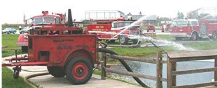
Tim Elder pumps a WWII trailer pump from the Collinwood Railroad Yard with other rigs behind