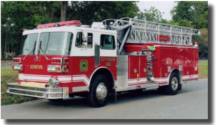
Geneva 1983, Sutphen 1500/500/65-ft, Rehab by Precision. Two ex-Cleveland rigs are in service in Ashtabula County, both 1983 Sutphen mini towers that have been rehabbed to like-new condition. They look quite similar to the days of their service in the City with the exception of doors added to enclose the jump seats. The refurbished rigs are located in Geneva and Trumbull Township but it is not clear where they were used in Cleveland.