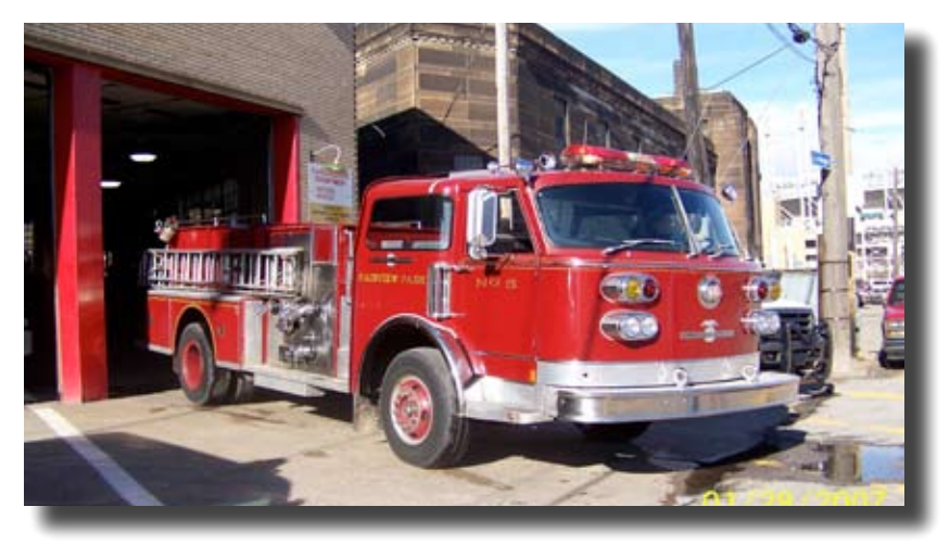
We recently acquired this 1980 LaFrance from Fairview Park. With help from our neighbors at BEARS the water tank was removed and the volunteers got to work transforming the apparatus into our funeral caisson. For more on this project see the article "Volunteers Needed" on page 3.

The Bugle is a publication of the Western Reserve Fire Museum at Cleveland, Inc., 310 Carnegie Ave, Cleveland, Ohio 44115. Entire contents © by Western Reserve Fire Museum at Cleveland, Inc.