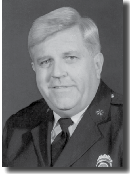
Retired Cleveland Fire Chief Appointed to Department July 18, 1960 Retired from Department April 5, 1996

Served as Chief from June 1, 1994 to April 5, 1996