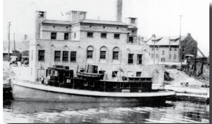
Station No. 21 with fireboat JOHN H. FARLEY tied up at dock.

The sixth of seven CFD fireboats was placed in service on October 15, 1954 at Engine Co. 21. It was named THE CLEVELANDER and is shown in this newly acquired photo. (Engine Co. 15 operated another boat named CLEVELANDER from 1894 to 1916.) In 1961 THE CLEVELANDER was reassigned to Engine Co. 15 and remained in service as the second fireboat until January 29, 1964 when that company was deactivated and the firehouse on Riverbed Road vacated. The vessel was kept in reserve and tied up at Station No. 21 until 1974 when it was sold to the Marine Development Co. based in Cleveland and converted to a tug. It carried a US Registry Number of 268373 until 1980 when it was sold to British buyers with further use unknown.