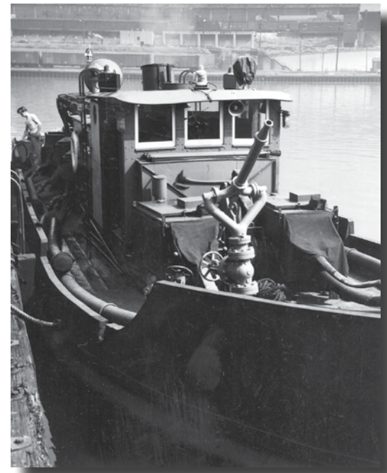
Above: Engine 21, converted lake fishing boat.