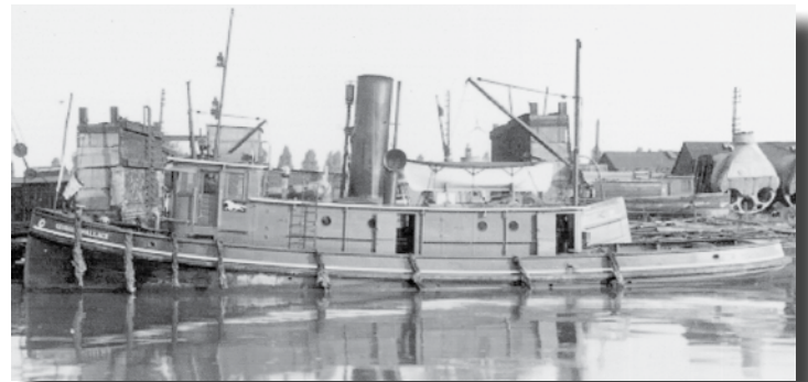
Former fireboat GEORGE A. WALLACE as tug in Halifax, NS renamed FOUNDATION WALLACE