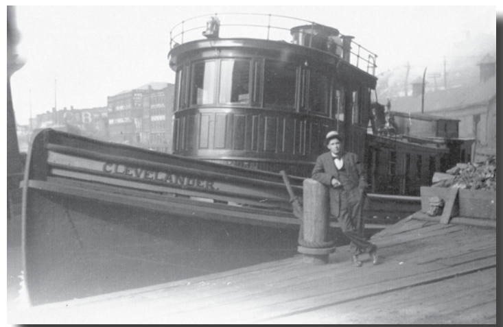
Fireboat THE CLEVELANDER in the Cuyahoga River in undated photo and unidentified individual.