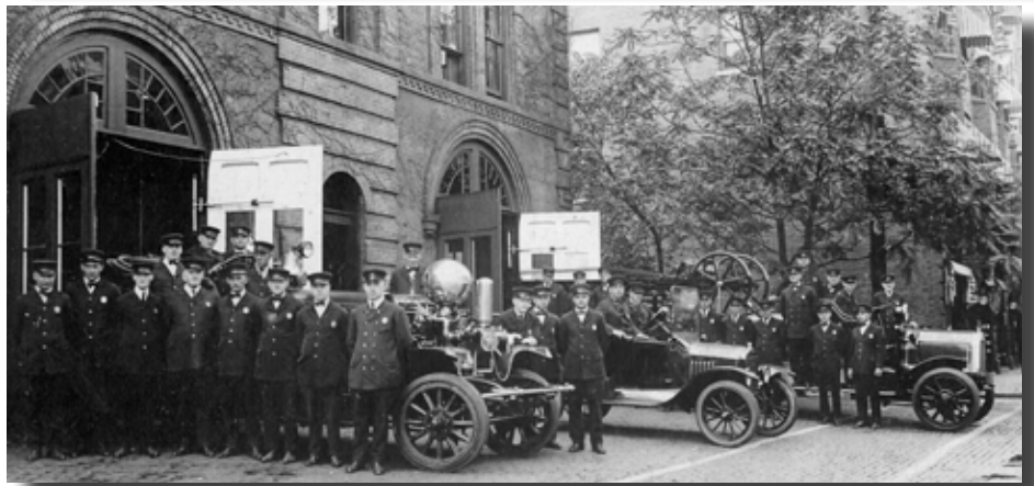
Photo to the right: Engine Co. 10, an 1918 Ahrens-Fox, 900gpm piston pump (left) Ladder Co. 8, an 1907 horse-drawn American LaFrance 65-foot aerial converted to motor driven 1913 Peerless Tractor (right) Battalion Chief 8 (at that time) roadster in center.