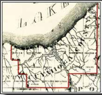
Cuyahoga County in 1808

Other items will be on display in the Jack and Lilyan Mandel Gallery to complete the fire fighting history story. Story boards will trace the development of Cuyahoga County from 1803, the annexations of communities by Cleveland, information on the current fire departments in Cuyahoga County and selected fire department histories of departments that no longer exist. The interactive fire safety area adjacent to the gallery will be open with some new components to add to the regular items.