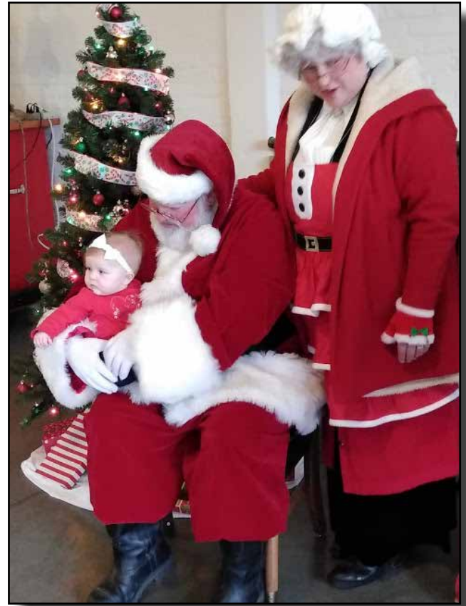
Santa visiting with some of the children