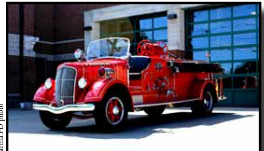
Parma FD photo

The new exhibit is entitled Sound the Alarm...Suburbs Respond to the Need for Fire Service. The fire departments of Fairview Park and Parma will be featured, both established in 1924. On display will be the engines from both communities, firematic items, historical displays of the fire departments, the apparatus builders and community history.