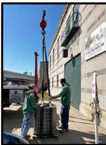
Air Conditioning Unit Being Lifted to Roof