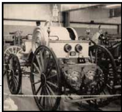
Cleveland’s 1874 Steiner Chemical engine

Chemical fire extinguishers were invented in France. By the 1870’s US fire departments began using them mounted on wagons for fire suppression. The technology consisted of tank containing a solution of dissolved sodium bicarbonate. A “charge” of sulfuric acid was dropped into the tank when operation needed. An exterior handle on the outside of the tank turned a paddle inside the tank. The resulting chemical reaction created carbon dioxide gas. The pressure of this gas forced the solution out of the tank, through a hose with a nozzle that directed the stream on the fire. It was very effective for small fires, or keeping it in check until the steamer arrived. Chemical tanks were also used on motorized apparatus with the technology used until the 1940’s. Booster tanks on apparatus were the replacement. Cleveland’s 1874 Steiner Chemical