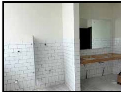
Men's Room Awaiting Countertop & Urinals