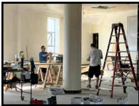
Joan Oliver Photo

multiple water fountains; and refurbished a janitors closet and added shelving. Gene Kingsley beautifully repaired the plaster molding, ceiling and walls. Comfort Environmental Heating and Cooling installed the ductwork and air conditioning. Suburban Marble & Granite cut and installed the window sills and will be installing countertops in the restrooms shortly. Moen Faucet of America graciously donated the faucets, urinal and toilet flush valves. A.C. Plumbing & Heating put in the gas line and will be donating their labor when they complete the plumbing work in the restrooms. Retired CFD Firemen Kenny Jordan, Bill Deighton, Richard Lash and Mark Robinson have generously volunteered their time and talents to help with the finishing work. Continued on Page 2 (Please see DORMITORY)