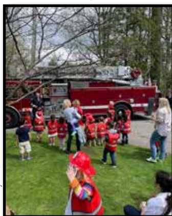
Kimberly Sandoval Kanner Photo