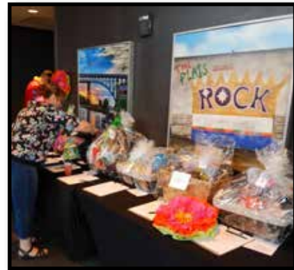
So Many Great Baskets to Bid On