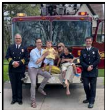
Kimberly Sandoval Kanner Photo