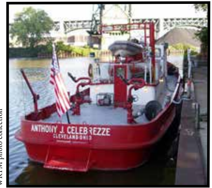
Crane and rescue boat added