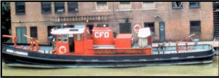
Original appearance red over black 1960's and 1970's