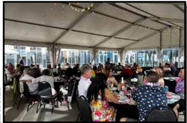
Luuu attendees wait to see if lucky winners