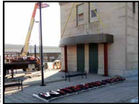
Front Entrance Fire Museum Sign Awaiting Placement