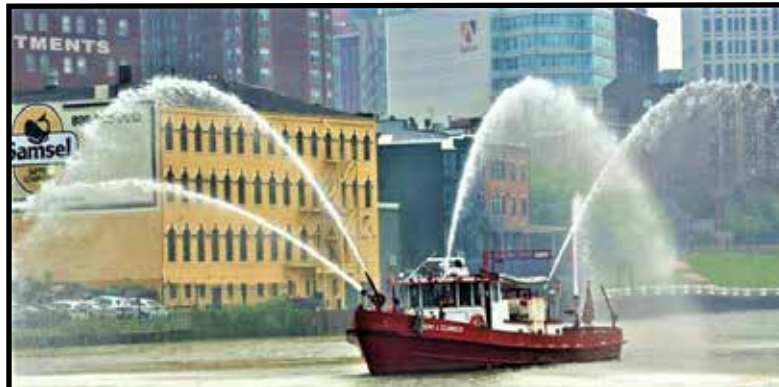
The Last Hurrah!!!

Playing away on the river at decommissioning ceremony June 28, 2023