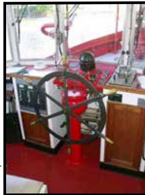
The wheel house