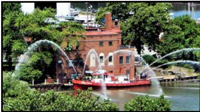
Four new deck guns forward and aft