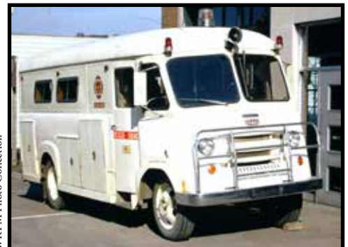
RS 4 1967 Sutphen/Ford fire rescue

On February 11, 2013 all three rescue squads, which had achieved ALS capabilities, were disbanded. It was part of the on-going activities surrounding the proposed merger of Cleveland Fire and EMS. Two new rescue companies were created as technical rescues without the ALS capability.