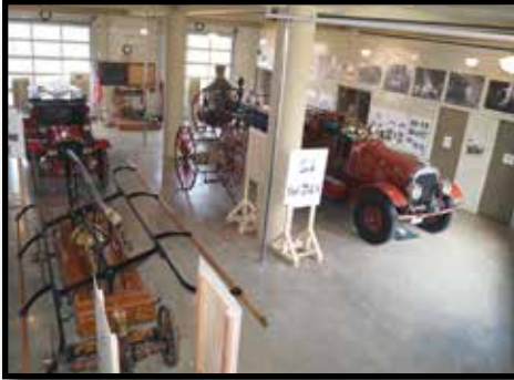
Overview of Exhibit

Since we judge many events in 10 year blocks of time, I thought it would be appropriate to look back 10 years to the fall of 2013 to see how far the Museum has come. In fact, 2013 was the real start of the Fire Museum as we know it today. The year 2013 was a key date in Cleveland Division of Fire's history because it was the 150th anniversary of the paid CFD.