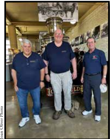
Joan Oliver Photo

The Museum is always looking for more volunteers. Please consider joining us and supporting our Fire Museum.