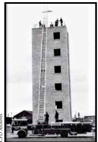
1962 Seagrave 100ft mid-mount in a drill at old FTA Drill Tower

Other bits of ladder trivia. Sutphen did not build aerial ladders and was a dealer for Pirsch ladder trucks. They had delivered two TDA's in 1969. Since 1965 Sutphen was Cleveland's only supplier of fire apparatus (pumpers, ladders and rescue squads all on commercial chassis). The last mid-mount straight chassis aerial ladder was a 100-ft from Seagrave in 1962 that went to Ladder 6 (Sta. 17).