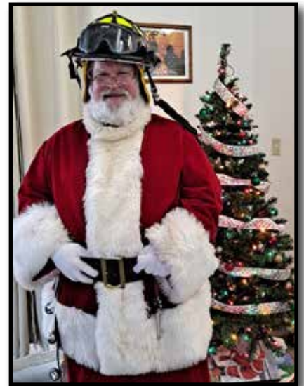
Chief Santa Claus to the rescue