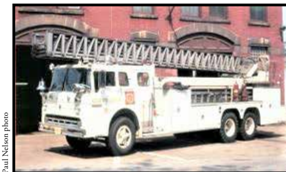
1971 Pirsch/Ford 100-ft rear-mount as Ladder 4

A: In 1971 with the delivery of two Pirsch 100-ft ladder trucks.