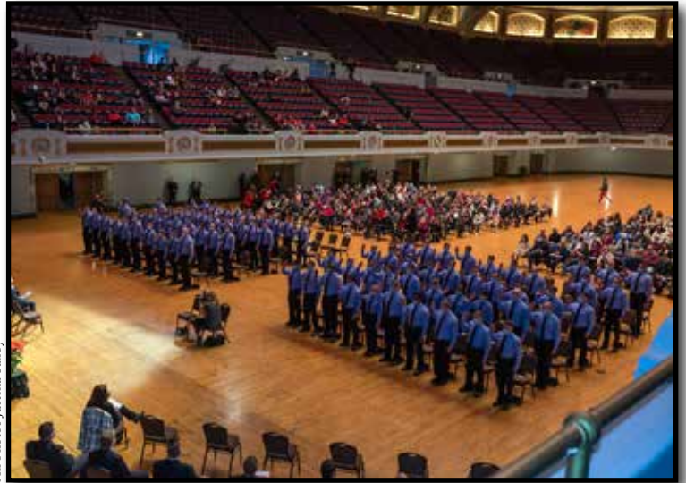
2021 CFD Cadet Class Graduation 12/21/21