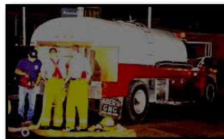
Sullivan A2722 (3000gal) at work with Engine 23