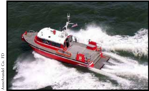
AnneArundel Co. FD