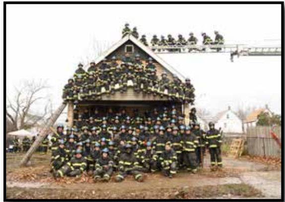
2021 CFD Cadet Glass as Training Exercise