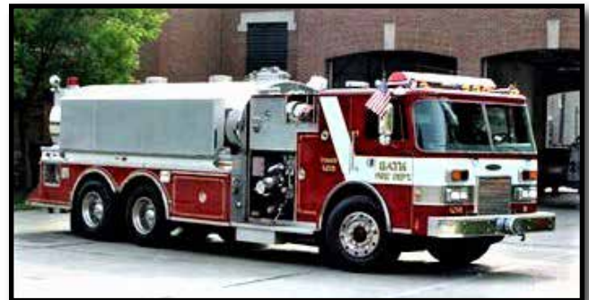
Bath 1218 (3000gal) at Station 20